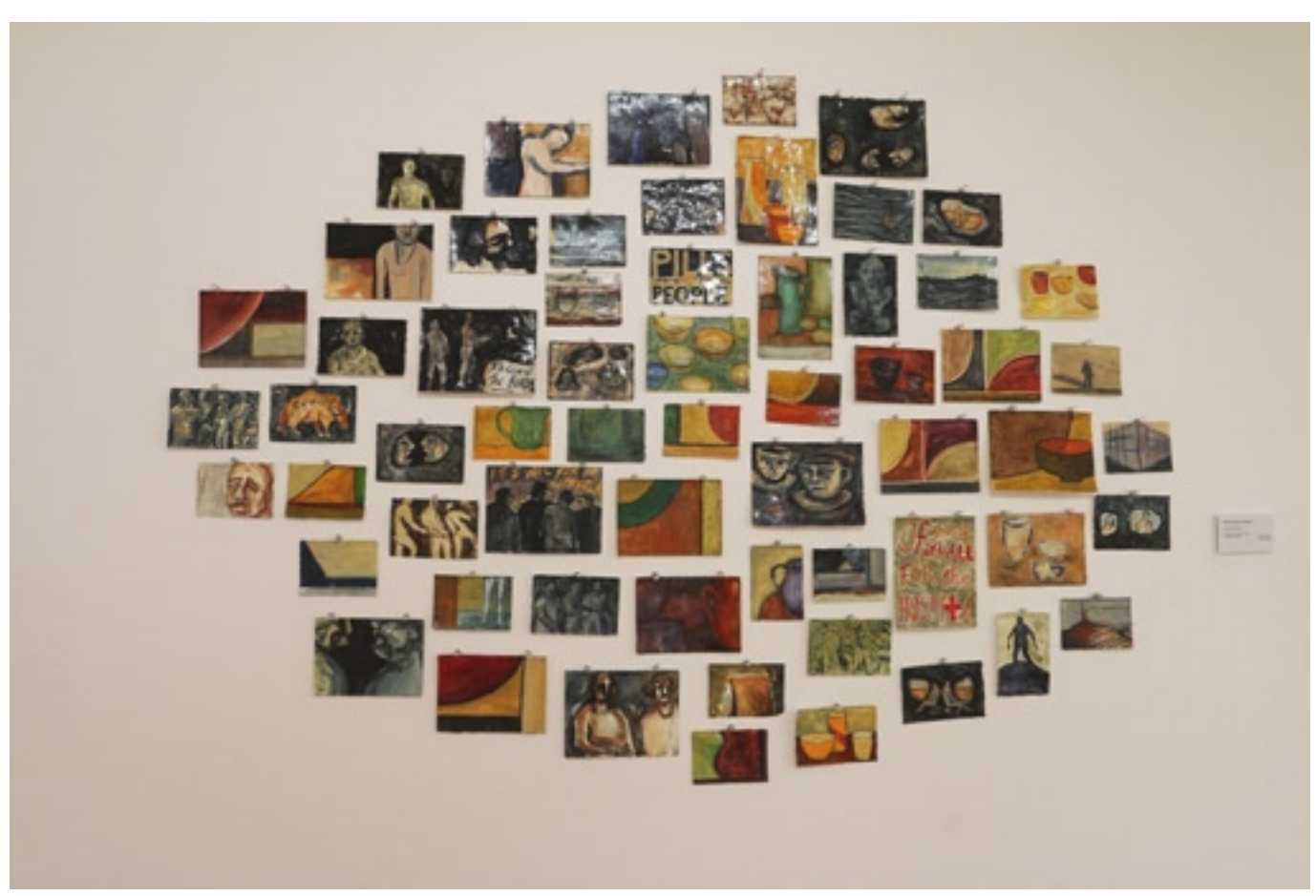
Pam Gilmour and James P Gilmour, the cloud, water colour and pigment on gesso panels, 2015