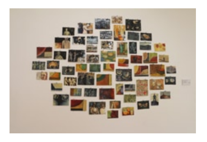
For scans of the cloud click here