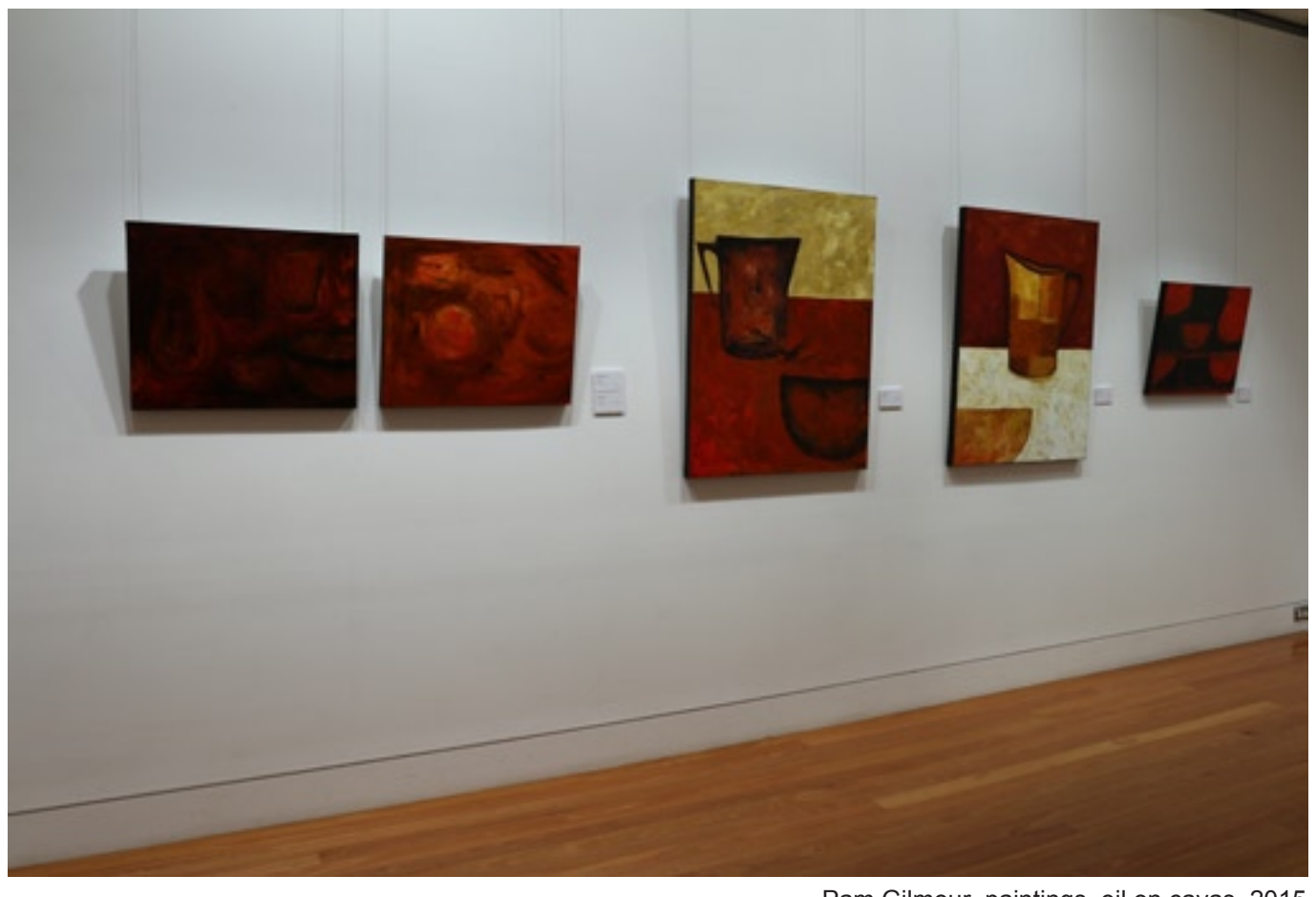
Pam Gilmour, paintings, oil on cavas, 2015