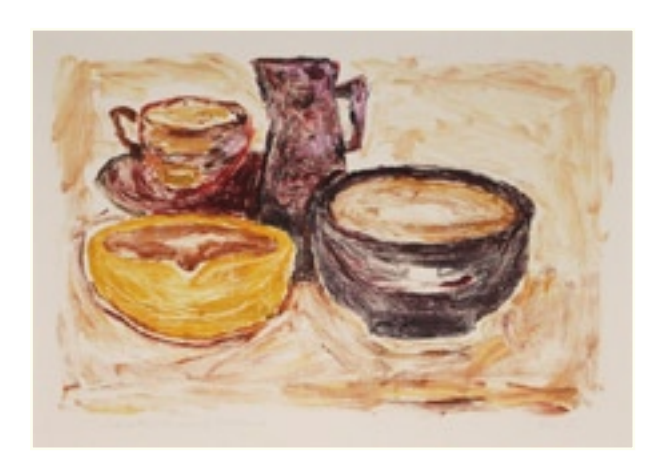
For all of Pam Gilmour's monoprints click here