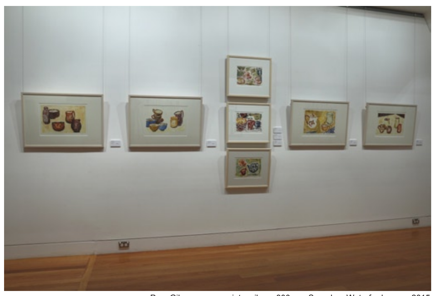
Pam Gilmour, monoprints, oils on 300gsm Saunders Waterford paper, 2015