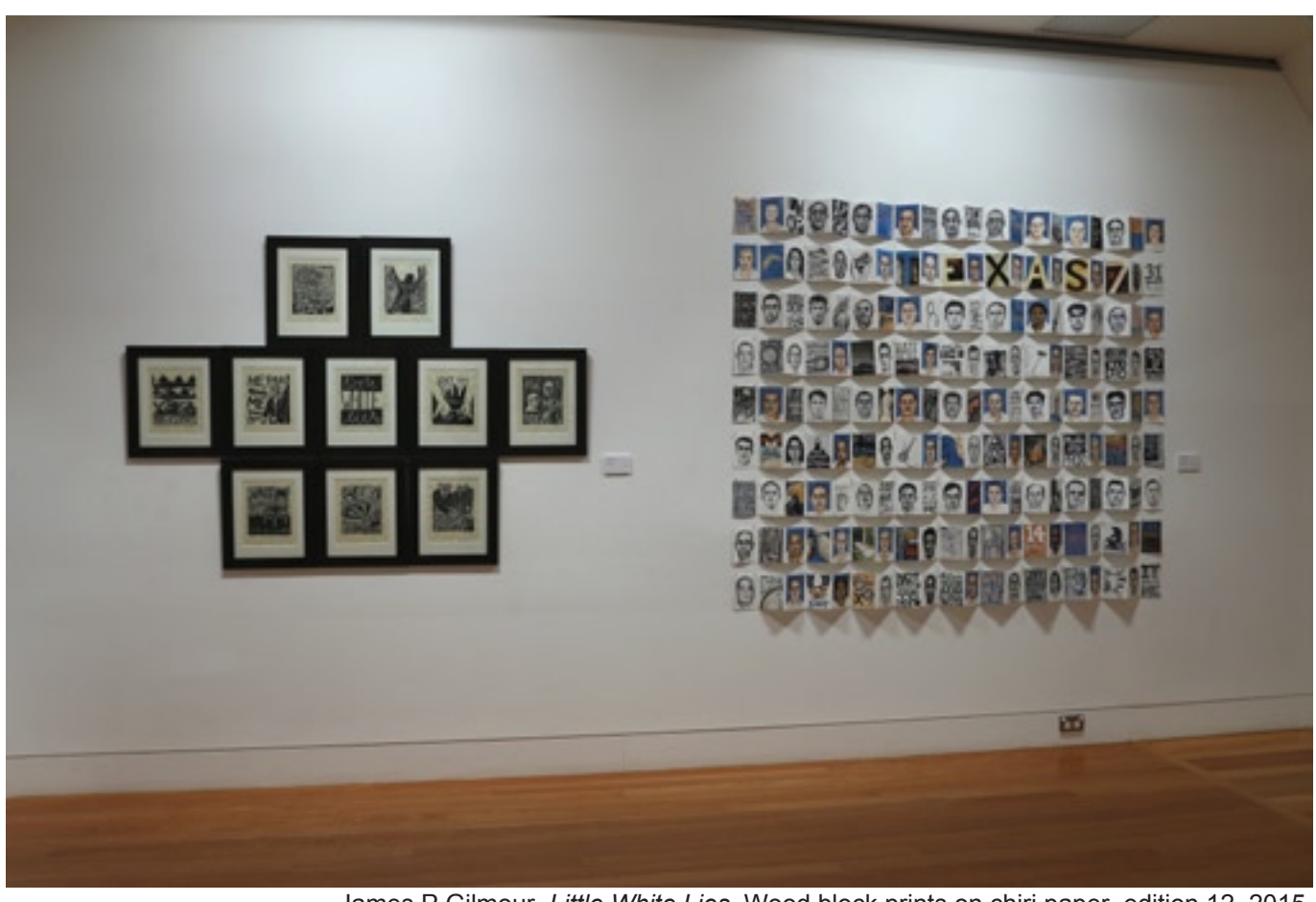
James P Gilmour, Little White Lies, Wood block prints on chiri paper, edition 12, 2015