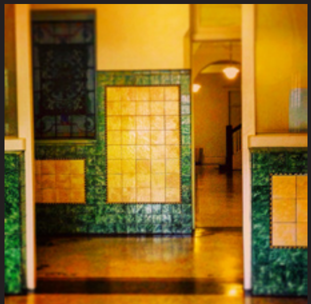
I know where you live