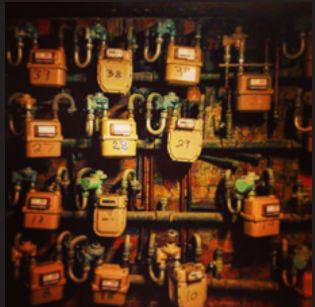
The gas room