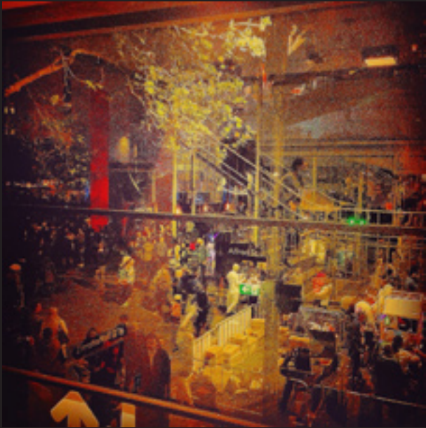
Ghosts in the machine