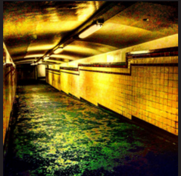
Flooding the exit