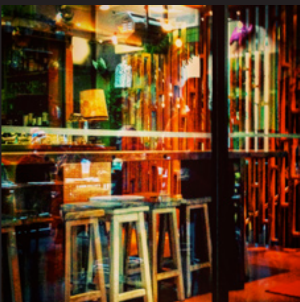
The place to be seen