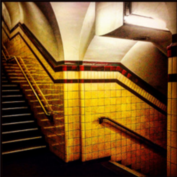
Lead me not into temptation