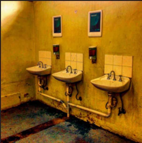
The importance of hygiene

email dannyoohyeah71@gmail.com for more information