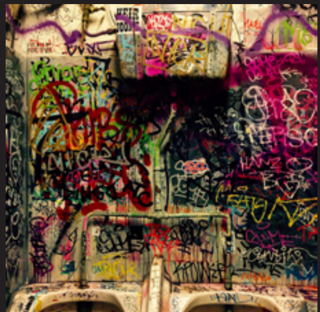
He never writes anymore