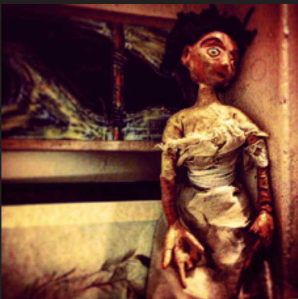
I need a hug